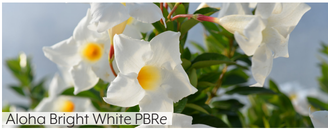
Aloha Bright White PBR