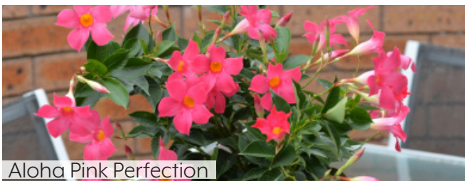
Aloha Pink Perfection