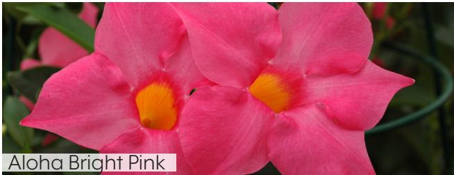
Aloha Bright Pink