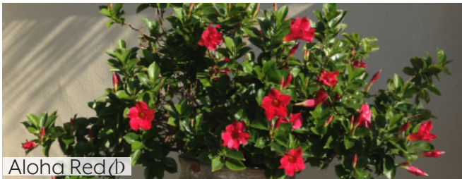
Aloha Red (D)